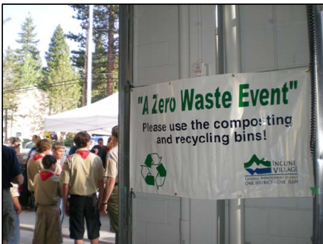
More than 20 community events achieved major solid waste reductions using composting and recycling services of the Lake Tahoe Zero Waste Project.