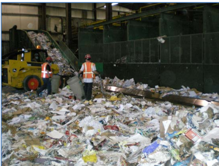
The District’s Single Stream (Blue Bag) recyclable materials are processed in Truckee at the Cabin Creek Materials Reclamation Facility.