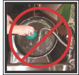
Don't wash FOGS down the drain

Did you know that the upcoming holidays are a challenging time for the operation of the community wastewater plant? In addition to the cold weather slowing down the bacteriologic processes used at the treatment plant, traditional holiday cooking waste such as fats, oils, and grease can cause sewer problems if disposed of improperly.