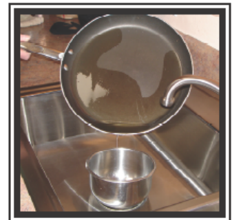
Do pour FOGS into another container

These materials can collect and create solid masses in the valves, pipes and lift stations of the wastewater collection system.